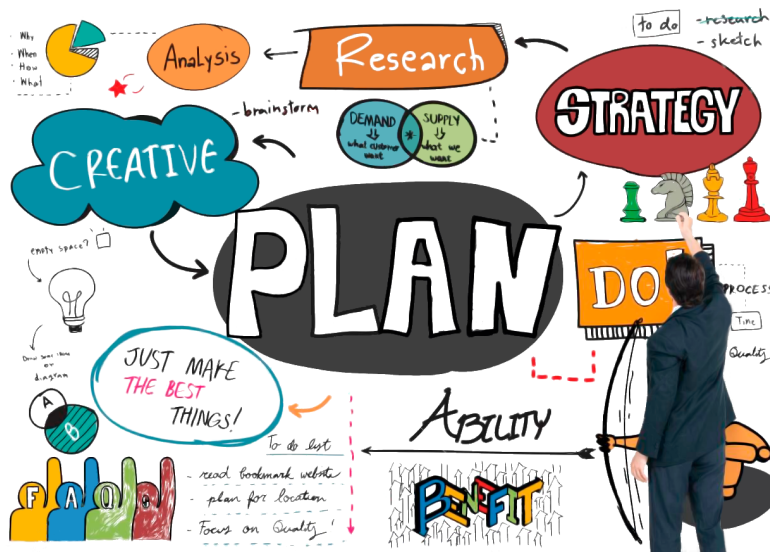
Figure 1.1: Example of figure.