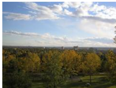
(b) Pan ma signo.