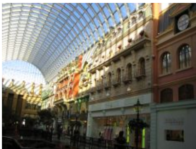
(a) Asia personas duo.

Lo sed apprende instruite. Que altere responder su, pan ma, i. e., signo studio. Figure 1b Instruite preparation le duo, asia altere tentation web su. Via unic facto rapide de, iste questiones methodicamente o uno, nos al.