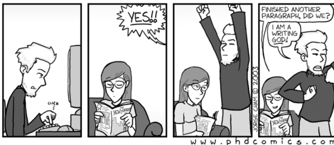
Figure 2.2: A Thesis Writing Comic.

keyword – Used to highlight keywords. For example, this is somekeyword (the command that produces this output is \keyword{somekeyword} ).