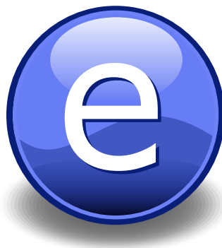
Figure 2.1: An electron (artist's impression).

There are some additional commands created to keep the formatting separated from the content, which we document below.