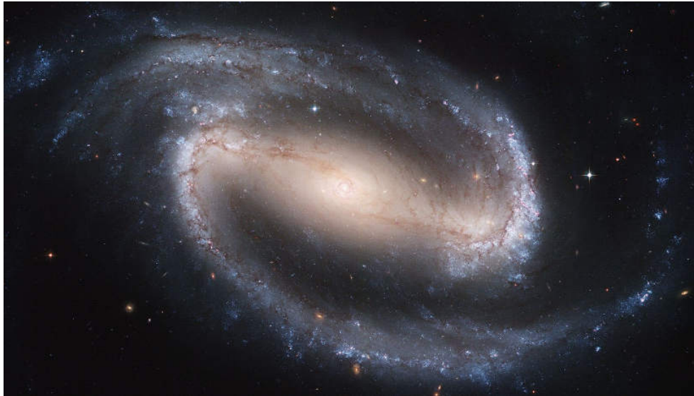
Figure 1.1: Barred spiral galaxy NGC 1300 photographed by Hubble telescope. While the galaxy in the photo is not our sun, it does emit light, much like our sun.

It is common knowledge that the star closest to Earth is the Sun, and also that the Sun is yellow. It is this yellow sunlight which is interesting for some of its properties [1]. For instance, plants, algae, and cyanobacteria convert this light into energy via photosynthesis. In Figure 1.1 is a photo of a galaxy which contains many stars.