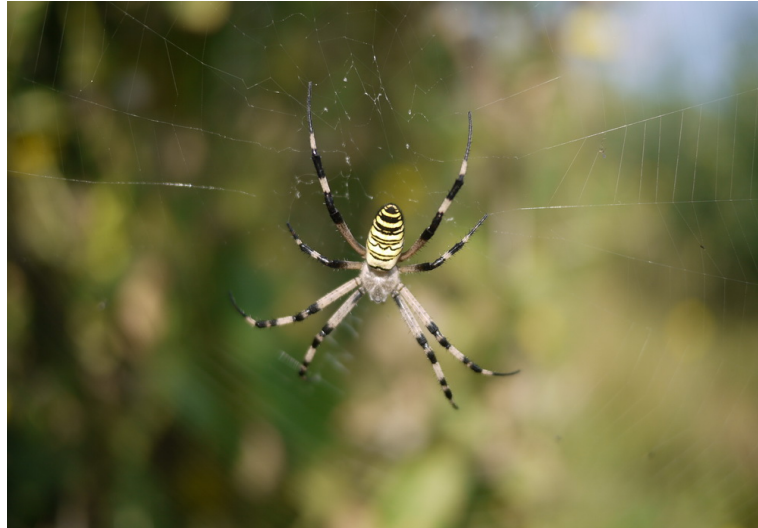
Figure 2: A spider, Picture from Didier Josselin.