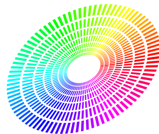
FIGURE 2.2: figure2